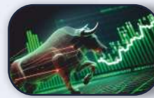
Practical Training on Stock Market