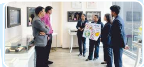
World Cancer day awareness program