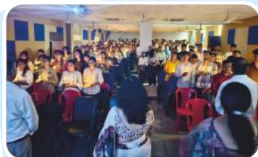
Induction Program, Oath Ceremony