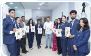
Unveiling event of KRUTI 2025