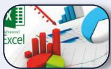
Advance Excel Techniques Seminar

Regular Sessions are conducted by industry experts helpful to bridge the gap between theory and practical knowledge. All the sessions are Free for DMIMS students. Students are trained in the following areas: