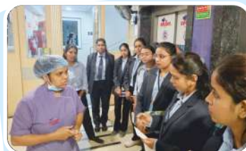
Hospital Visit by Health Care Students