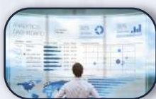
Real-World Applications of Power BI