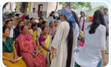
Village Immersion Program (VIP)