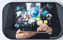
Ins & Outs of Digital Marketing